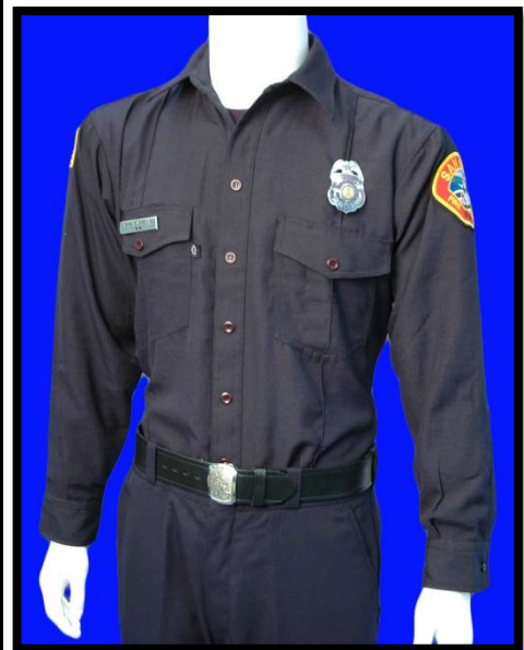
Class "B" Long Sleeve