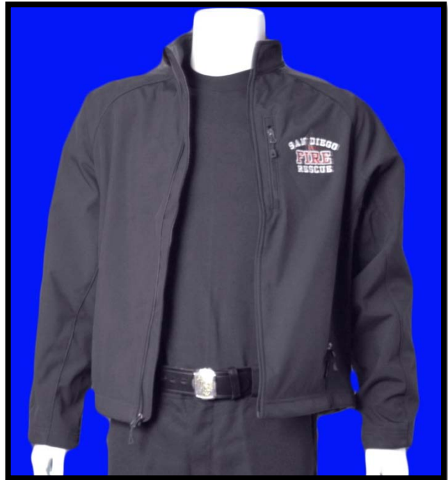
Class "C" Jacket