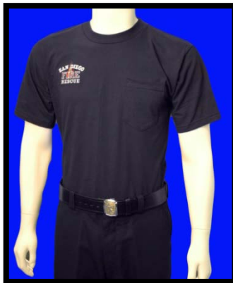
Class “C” w/Pocket shirt