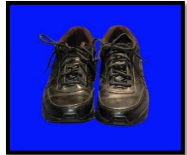
MOD Team Athletic Shoe