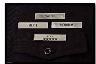
Multiple Commendation Bars