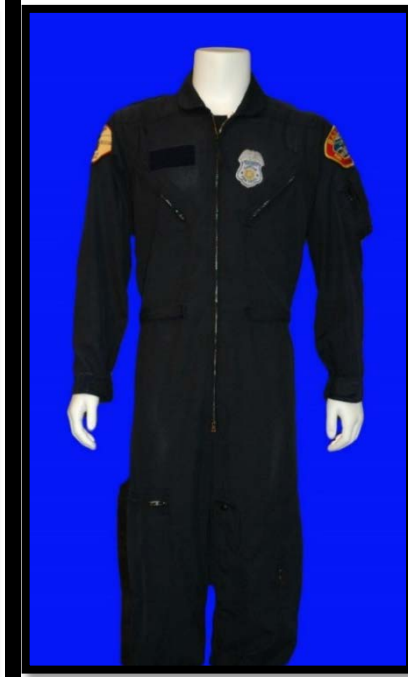
1- Piece Flight Suit