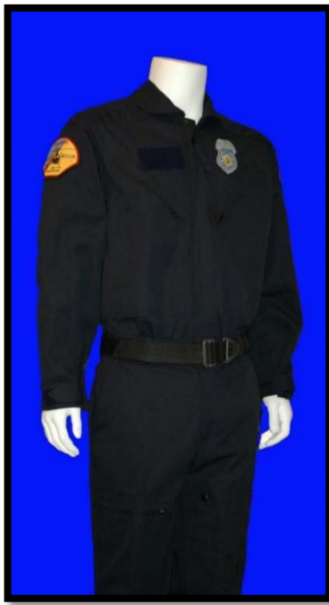
2-Piece Flight Suit