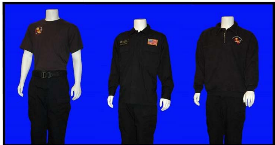
Various US&R Uniforms