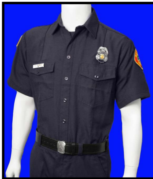
Class "B" Short Sleeve