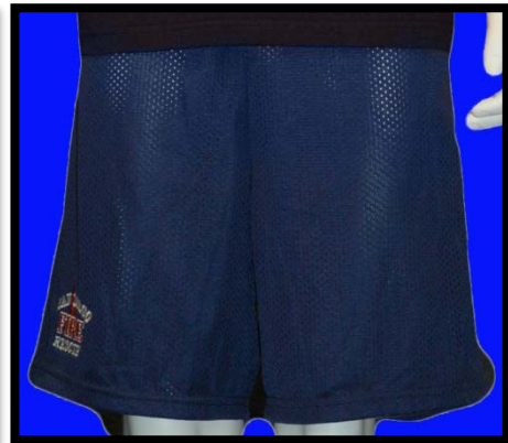
Gym Style Short