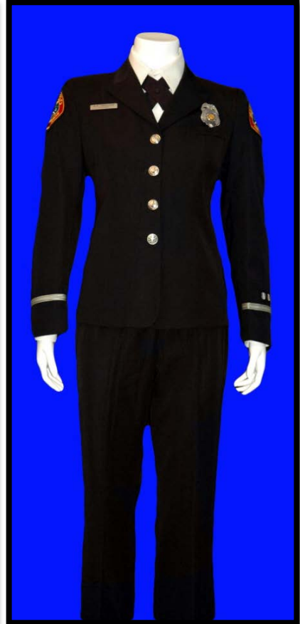
Women's Class "A" Pant