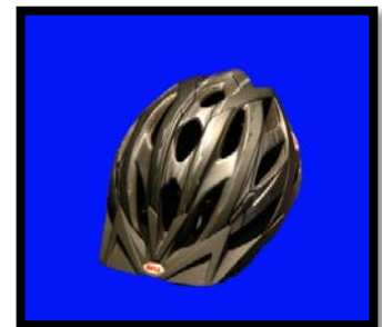
MOD Bike Helmet