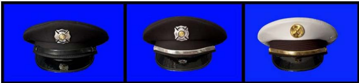
Non Officer's Class "A" Cap