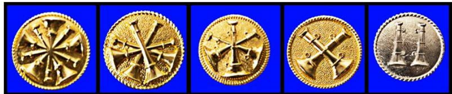
Fire Chief Assist. Chief Deputy Chief Battalion Chief Captain