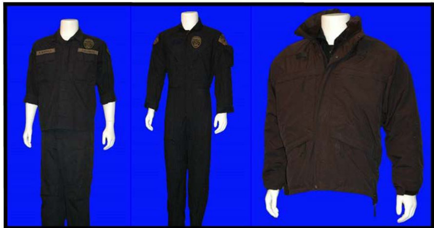
Various STAR Team Uniforms