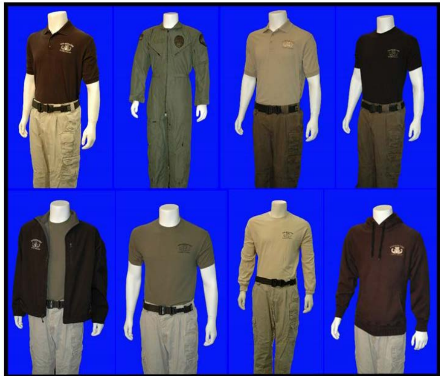
Various Bomb Squad Uniforms