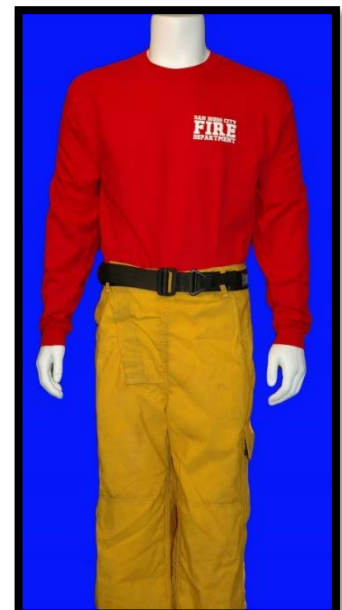
Training Instructor Alternative Uniform