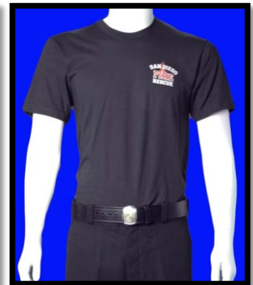
Class “C” T-shirt