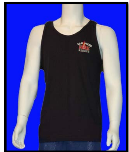
Class "C" Tank Top