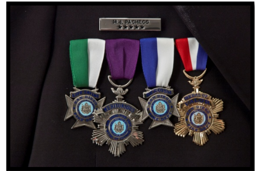
Multiple Commendation Medals