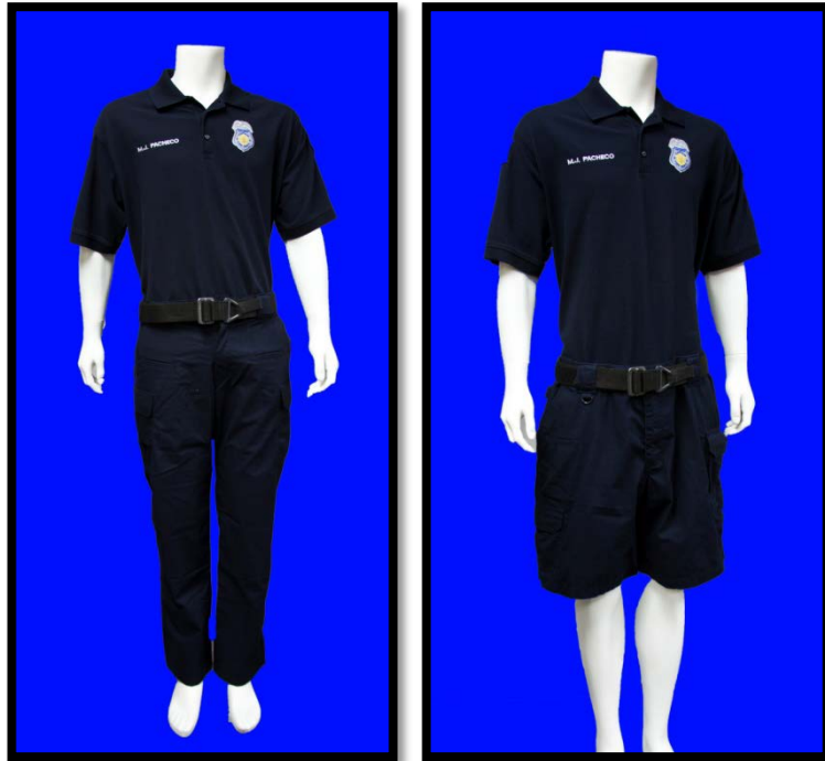
Various MOD Team Uniforms