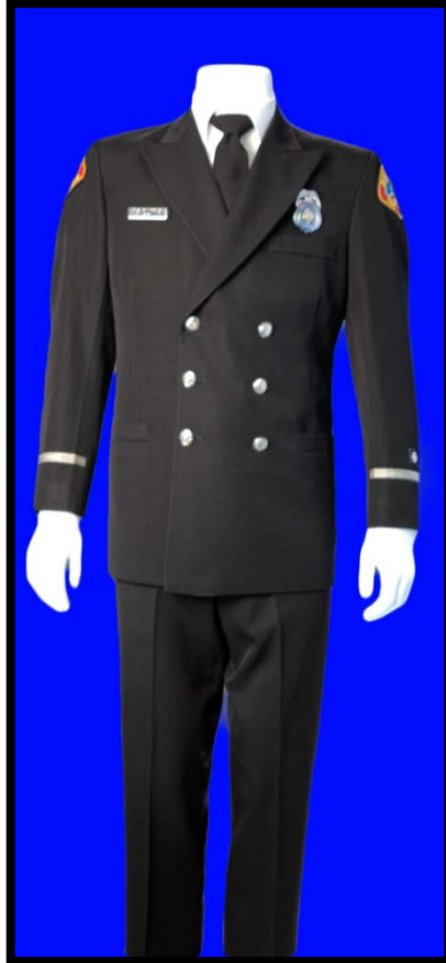
Men's Class "A"