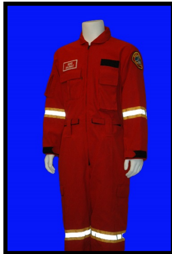
HAZMAT 1 Piece Jumpsuit