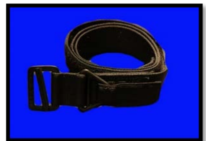
5.11 or CMC Style Tactical Belt