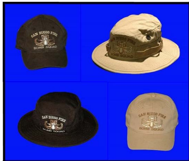
Various Bomb Squad Work Caps