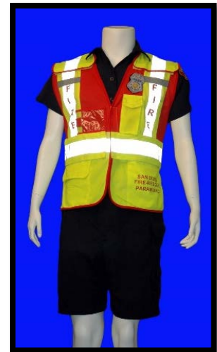
MOD Team Vest