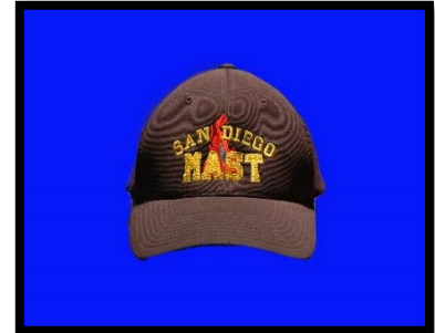
MAST Work Cap