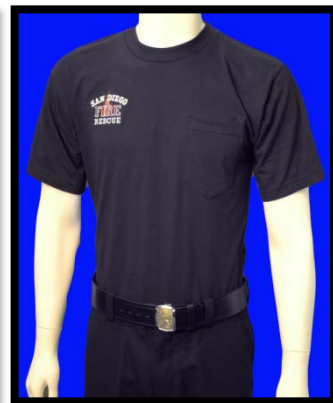
Class "C" T-shirt w Pocket