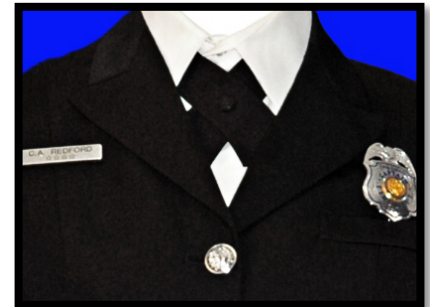
Black Crossover Tie