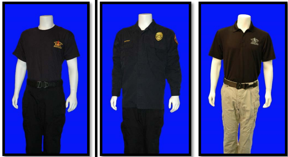
Various MAST Uniforms