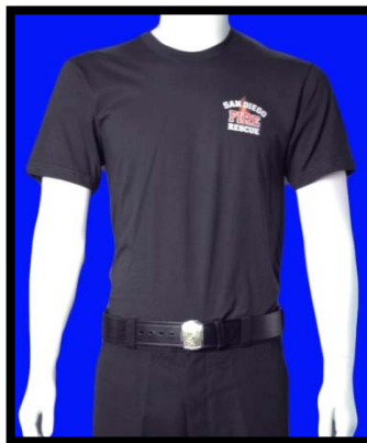
Class "C" T-shirt