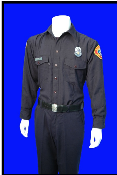
Class "B" with Long Sleeve