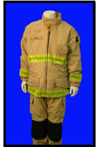
TRT Protective Equipment