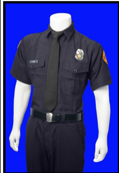
Class "B" with Tie