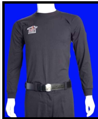
Class “C” Long Sleeve