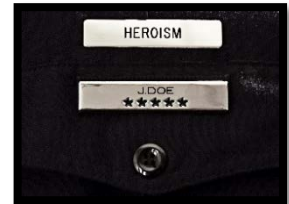
Single Commendation Bar