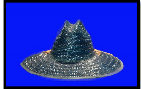
Training Alternative Work Hat