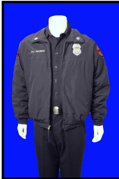
Class "B" Jacket Sleeve