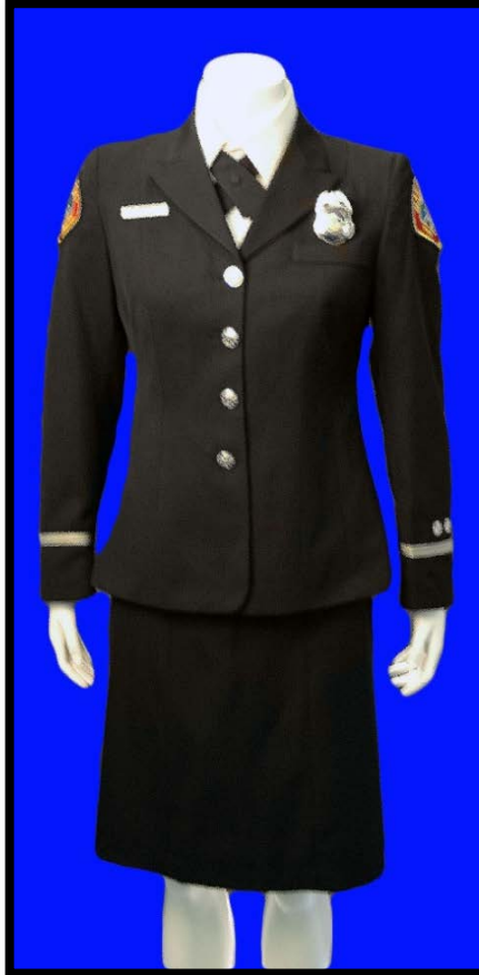
Women's Class "A" Skirt