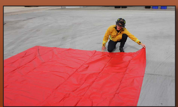
Repeat the previous two steps on the opposite side of the cover