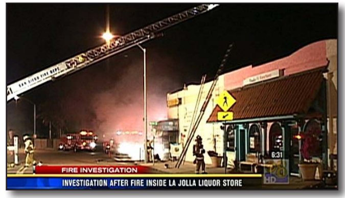
Figure 23-24 Liquor store fires present an added challenge during overhaul requiring the involvement of the ABC, PD, and store owner.

In liquor store fires, a representative of the Alcoholic Beverage Control Commission, as well as the owner, should be present before packaged goods are removed from the building or fire area, Figure 23-24. If this is not possible, the Incident Commander should set up accounting procedures and request police department assistance to guard the contents.