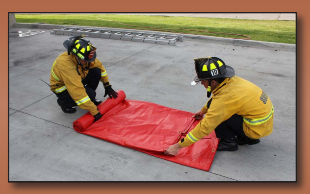
Roll the cover while your partner takes up the slack and keeps cover in line