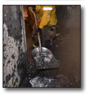
Figure 23-21 Debris carriers and scoop shovels are essential pieces of equipment used during overhaul.