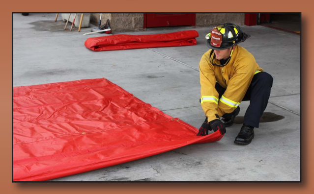
Anchor your hand at the halfway point of the previous fold