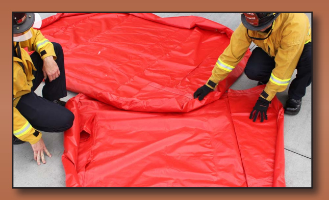
Unfold the top 10" of the chute and tuck under the corner of the catch-all