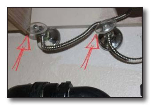
Figure 23-10 Localized water shut-of valve

Securing the water at the source is usually accomplished by locating the appropriate shutoff valve, Figure 23-10, or by plugging the leak. In some instances it may prove useful to have multiple personnel working to secure the source by various methods. For instance when attempting to secure a fused sprinkler head, individuals may be assigned to locate a shutoff valve while another is assigned to locate the PIV or OS&Y while others are attempting to plug the sprinkler(s).