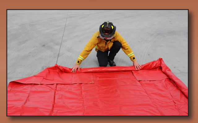
Repeat the previous step on all sides of the catch-all, rolling the sides inward approximately 2' to 3'