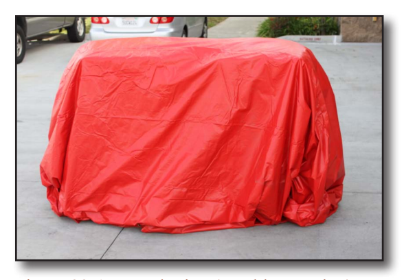
Figure 23-17 Enveloping (Double Bagging)