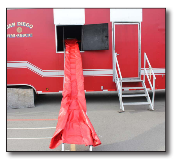
Figure 23-18 Ladder Chute

It is quite possible that water will have been trapped in the cover during this process. It is much better to have trapped water dumped outside than to dump it next to the merchandise. Also remember that keeping the cover wet until it can be cleared will prevent carbon and ash stains from solidifying.