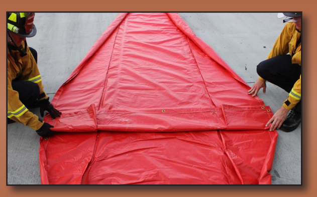
Fold over the first 10" of the 20" flap onto the previous fold