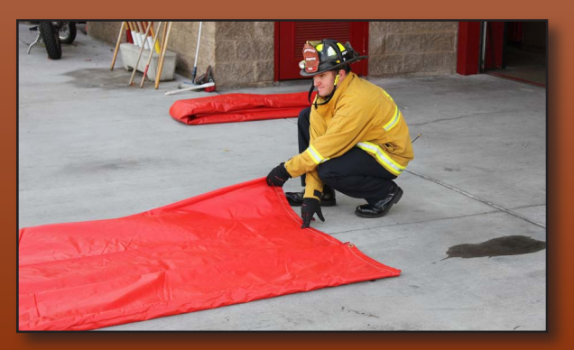
Anchor your hand at the halfway point of the previous fold