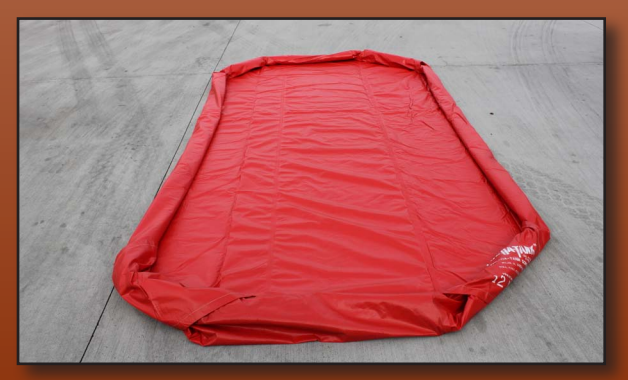
The finished catch-all can be folded in half and transported to the necessary location