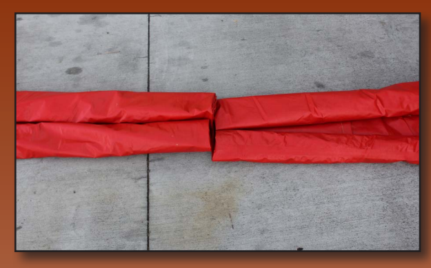
To connect a chute to another chute, butt the top of one chute to the bottom of the next chute