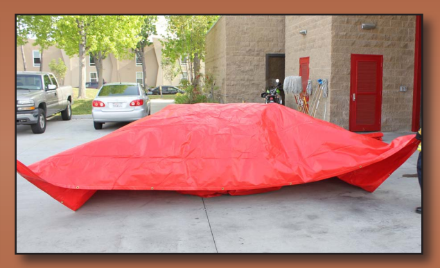
Cover the items with a second salvage cover