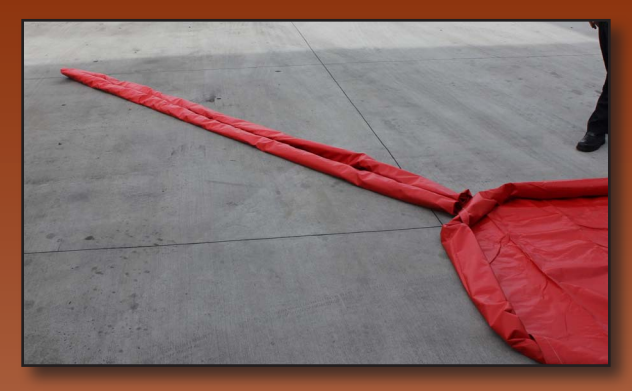
To connect a chute to a catch-all, butt the top of the chute up next to a corner of the catch-all