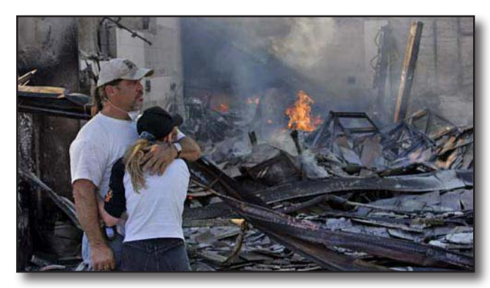
Figure 23-29 It is important to remember the human aspect of our job and to be empathetic towards fire victims. Often times the structure fires we respond to contained everything a person owned except for the clothes on their back.