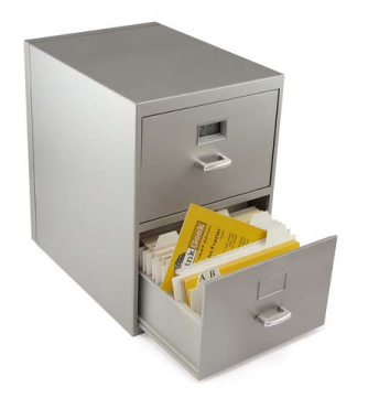
Figure 23-9 File cabinets and contents contain valuable information for buisnesses and should be a salvage priority

In office buildings the property of most value are usually computers, filing cabinets, Figure 23-9, and expensive electronic equipment.