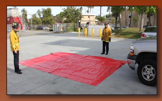
Lay out the salvage cover in front of the object to be covered.