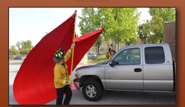
Once airborne, move cover over the object in one smoothe motion