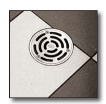
Figure 23-1 Commercial Floor Drain