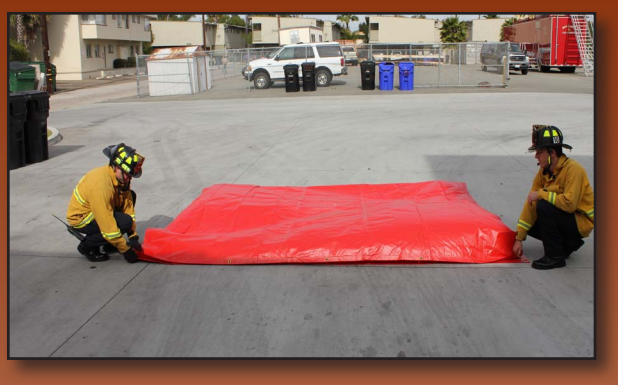
Build the small catch-all in the same manner as the large catch-all previously described