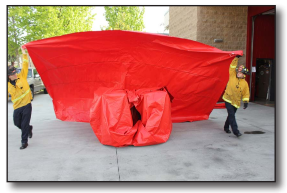
Figure 23-16 Single-Edge Snap Throw