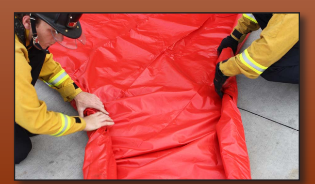
Roll both the catch-all and chute back up towards each other to secure them in place