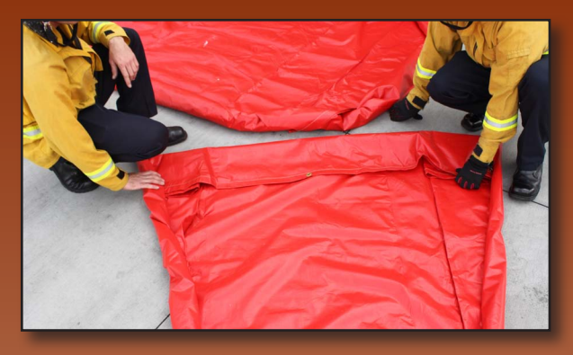
Unroll te top of the chute