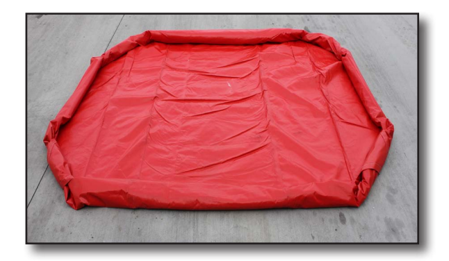
Figure 23-12 Catch-All