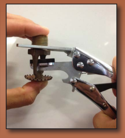
STEP 2 Push the tool forward aggressively until it cannot go any further.