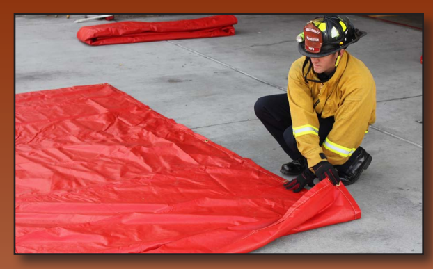
With a partner opposite of you, spread cover out and position yourself at lengthwise ends