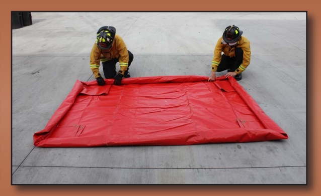
Roll all sides inward 1' to 2'