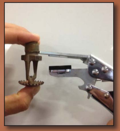
STEP 1 Slide the upper arms of the tool around threaded portion of the fire sprinkler.