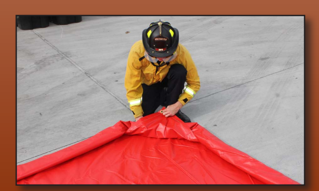
Grab the inside flap and fold back over the corner, tucking the corner under the outside of the catch-all