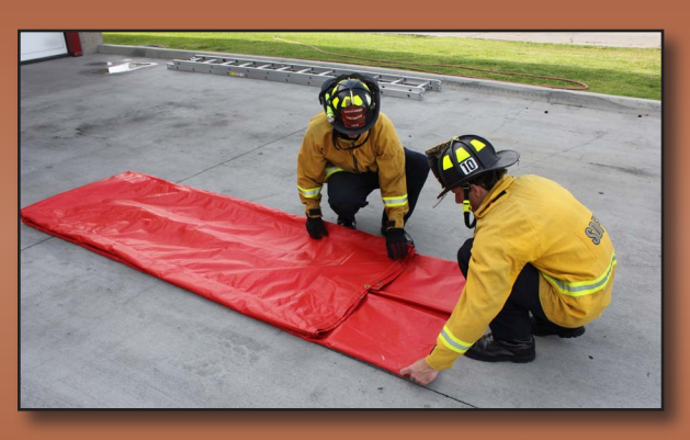
Stop short and stagger the ends approximately 12" to 16"