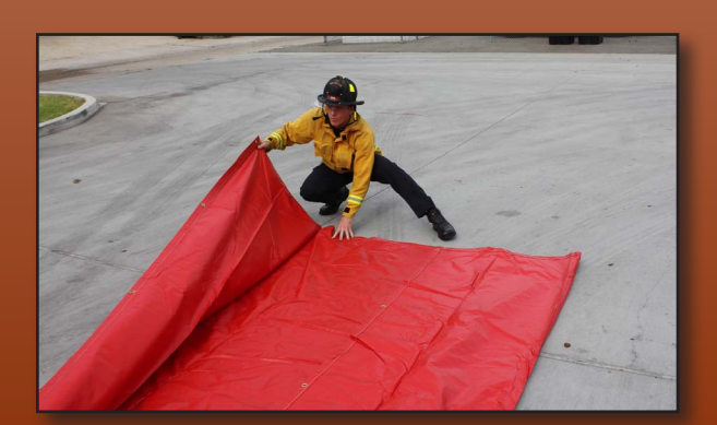
Unfold the second layer flap of the salvage cover