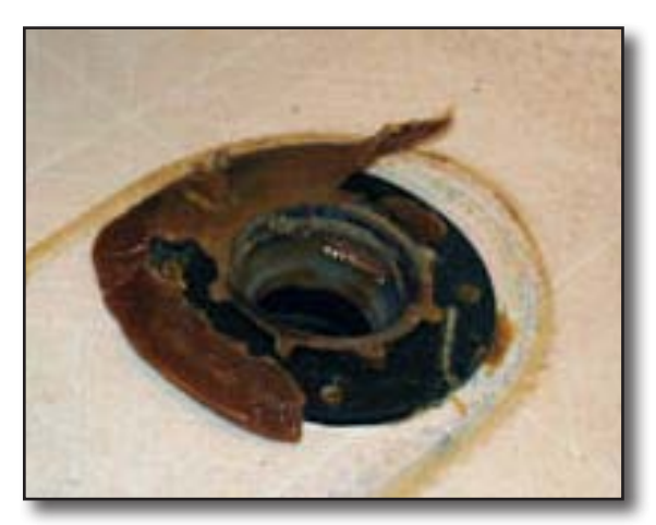
Figure 23-19 Removing a toilet and the wax ring can create a floor drain to remove large quantities of water

While firefighters begin to address the source of the water flow as well as containing the water consideration should also be given to channeling the water to a desired location. In some instances it may be desirable to channel the water to a basin for collection then removed from the structure using a sump pump. In other cases it may be desirable to channel the water out of the structure, while yet another option may be to channel the water toward a floor drain.