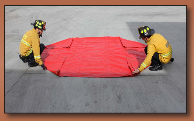
Fold all four corners inward 2' to 3'