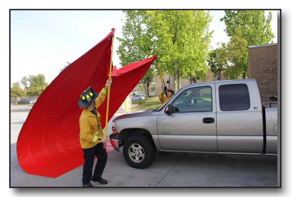
Figure 23-15 Balloon Throw