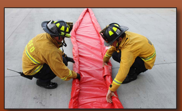
Roll both edges of the chutes back together to complete