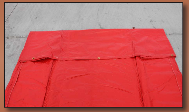
Fold 20" on the other end of the salvage cover back on itself, this will be the bottom of the chute