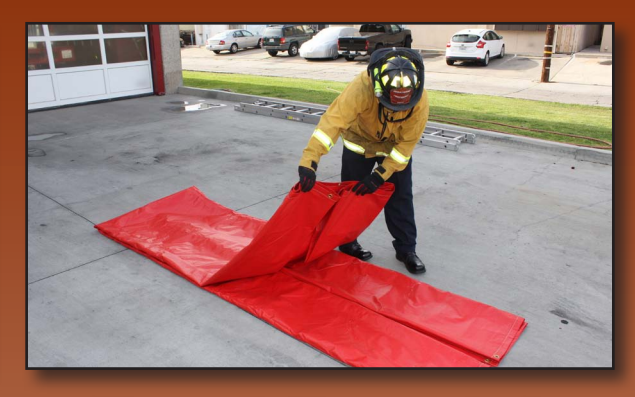
Take one end of the cover and walk it down towards the opposite end