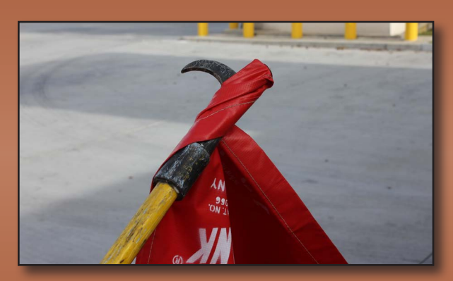
Place two pike poles through the corner grommets and twist around once, be sure to not puncture the cover with the hook