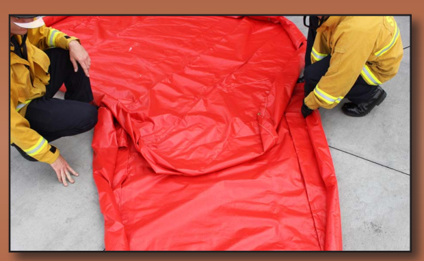
Unroll the corner of the catch-all