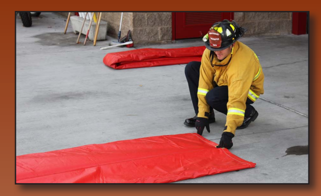
Fold this quartered section one more time toward the center of the cover