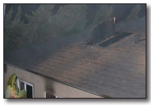
Figure 23-27 Ventilation holes should be covered with visqueen prior to turning the structure back over to the homeowner.

Fire protection systems must be placed back in service. This would include replacing used sprinkler heads, using wooden plugs or special head closing devices (sprinkler tongs), re-engaging the post indicator valve or OS & Y valve and checking for leaks. Standpipe systems should be drained by the fire department if they are dry systems. Wet systems are usually handled by the