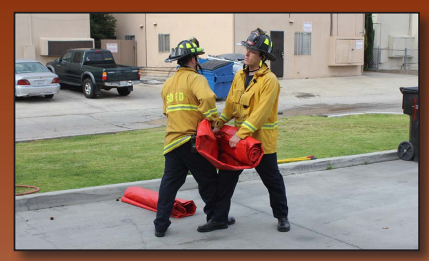
With a partner, place the rolled slavage cover across your knees and grasp opposite ends of the cover. Check over each other's shoulder for obstructions