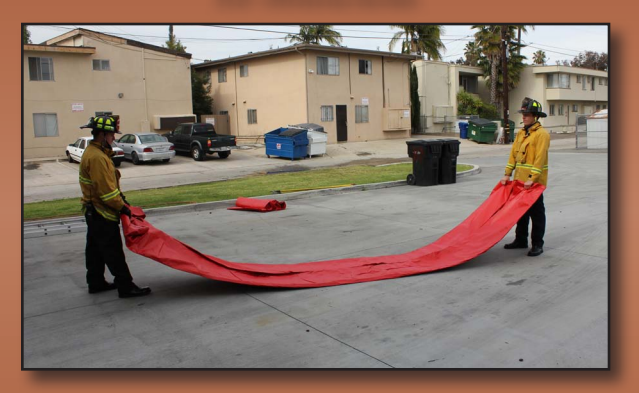
Place the cover on the ground