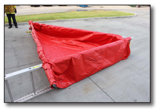
Figure 23-13 Water Basin

A basin can be made for containing larger amounts of water than a catchall can hold, Figure 23-13. For example, continuously flowing water out of a ceiling can be channeled into the basin for storage prior to removal with a sump pump.