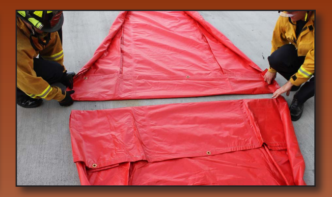
Unroll both chutes