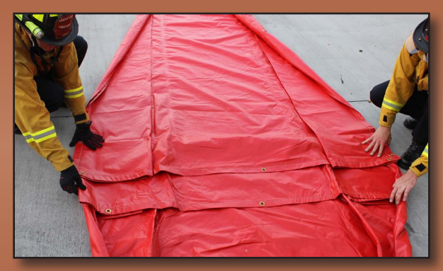
Unfold the 10" flap and place over the 20' flap