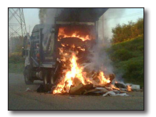
Figure 23-25 Trash truck fires present a significant overhaul challenge and often require heavy equipment to assist.

Bank fires are not too great a problem as most of the money will be in a protected vault at night and employees present during the workday. There should be some cooperation between the bank's staff and overhauling firefighters to help accountability of the bank's contents.