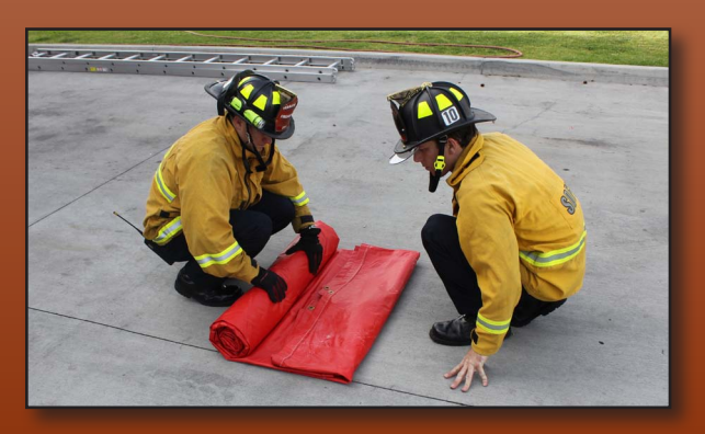
Fold the exposed 12" to 16" staggered flap from the bottom of the cover over the top half of the cover to lock the ends in place