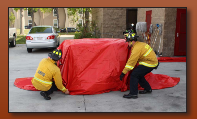
Tuck the loose edges of the top salvage cover under the items to lock in place