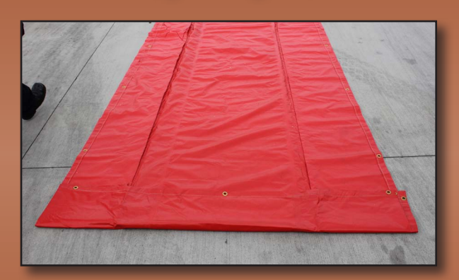
Fold 10" of one end of the salvage cover back on itself, this will be the top of the chute