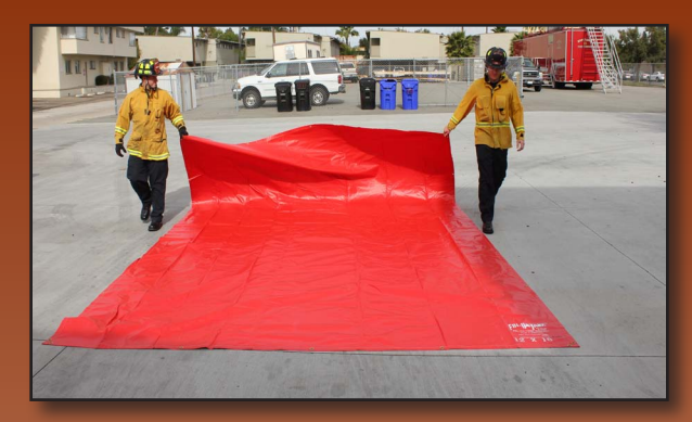
Begin by folding the salvage cover in half, lengthwise