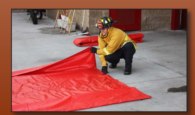
Go to the opposite edge and make your first fold to the center of the cover.