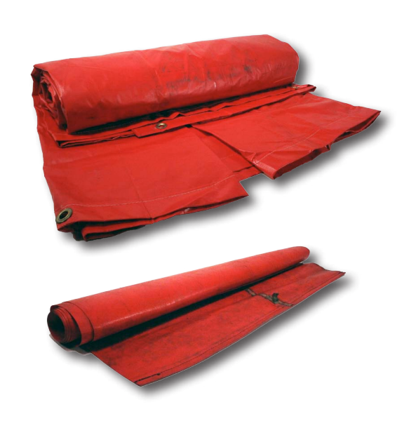
Figure 23-5 Salvage Cover and Hall Runner

These covers have hemmed and grommeted edges for reinforcement and hanging. Salvage covers are not fire resistive. They are expensive so care should be taken when placing them to avoid areas where they may be subjected to heat and embers. Use the grommet holes to hang salvage covers, do not drive nails through the salvage cover. Additionally salvage covers should not be placed where they will be walked on or used to carry debris. After each use salvage covers should be inspected and cared for using mild detergent and water then hung to dry. Once salvage covers are dry they can be rerolled and placed back on the apparatus. A monthly inspection of the apparatus salvage covers should occur. During this inspection the salvage covers should be removed from the apparatus, inspected for damage, repaired or replaced as needed, refolded and rolled, then placed back in service on the apparatus.