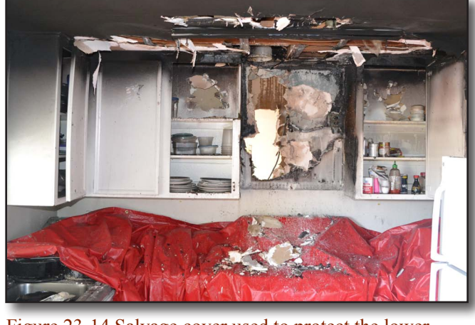
Figure 23-14 Salvage cover used to protect the lower cabinets and counter tops prior to overhaul of the ceiling.

and hang the cover as a sheet. The basic techniques used for deploying salvage covers are: