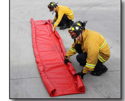
Figure 23-11 Water Chute

Oftentimes a bucket and sponge is placed under the main drip. The catchall may also be used as a temporary means to control larger amounts of water until a time when chutes or basins can be constructed. Properly constructed catchalls will hold several hundred gallons of water and often save considerable salvage work. The cover should be placed into position as soon as possible, even before the sides of the cover are rolled.