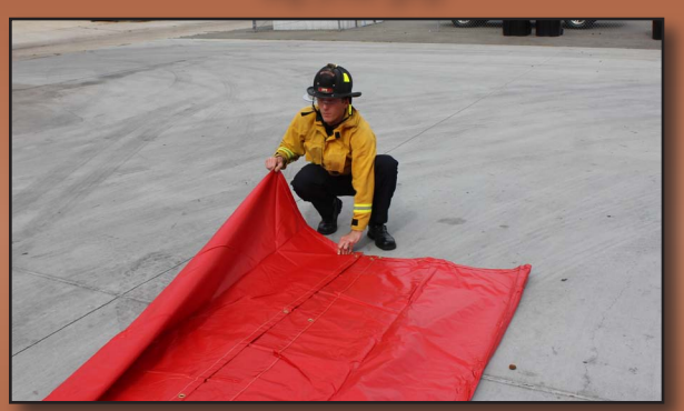
Unfold the first layer flap of the salvage cover