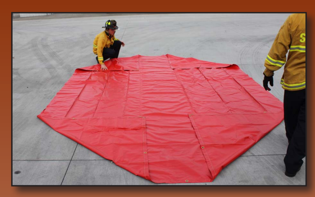
Spread out cover using two firefighters. Fold each corner inward approximately 3' to 4'