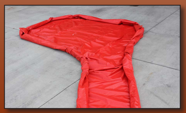
The catch-all can now be drained using the chute to transport the water