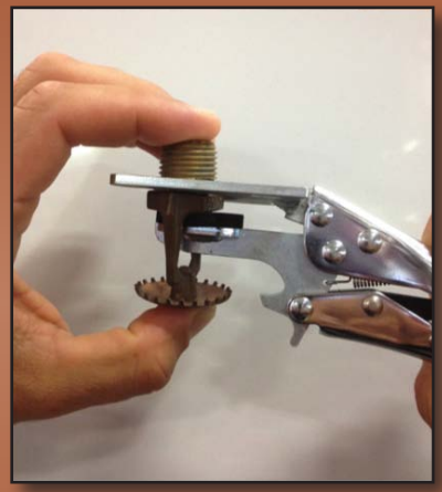
STEP 3 Squeeze the handle until the tool locks in place.

Note: Adjust the placement of the lower arm by tightening/loosening the nut and bolt on the end of the handle.