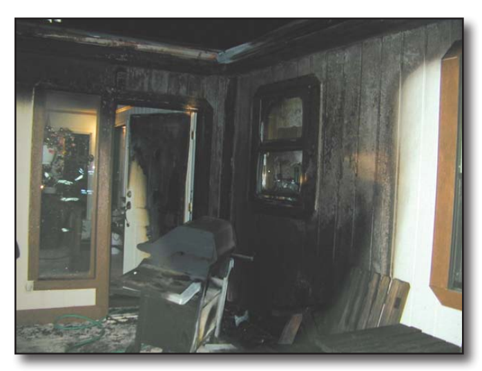
Figure 23-26 Every attempt should be made to preserve the room of origin and any significant fire patterns until after the investigators have completed their work.

Firefighters have a very important role in determining the cause of the fire and can aid the fire investigators by collecting data and preserving evidence. During fire scene overhaul the firefighter has a responsibility to not destroy evidence, Figure 23-26. Many times the Incident Commander must stop overhaul operations altogether after fire extinguishment to avoid further damage or the possibility of destroying evidence. This gives the fire investigators time to examine all possible evidence of fire cause. Refer to Fire Investigation chapter for more detailed information regarding fire origin and cause determination and evidence preservation.