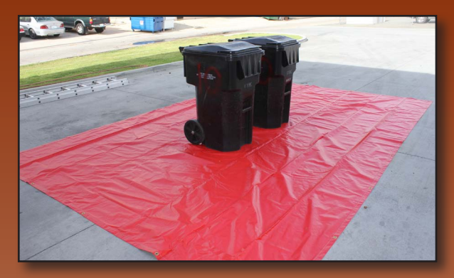
Place the items to be protected on top of a salvage cover