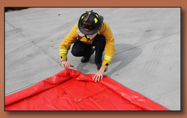
Roll each corner inward again approximately 1' but stopping short to leave the inside flap exposed