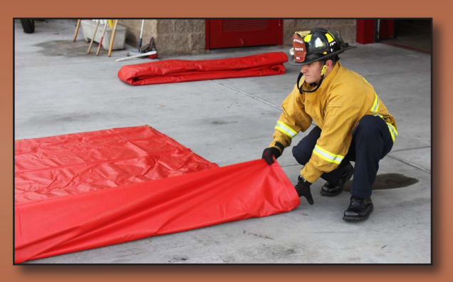
Fold this quartered section one more time toward the center of the cover