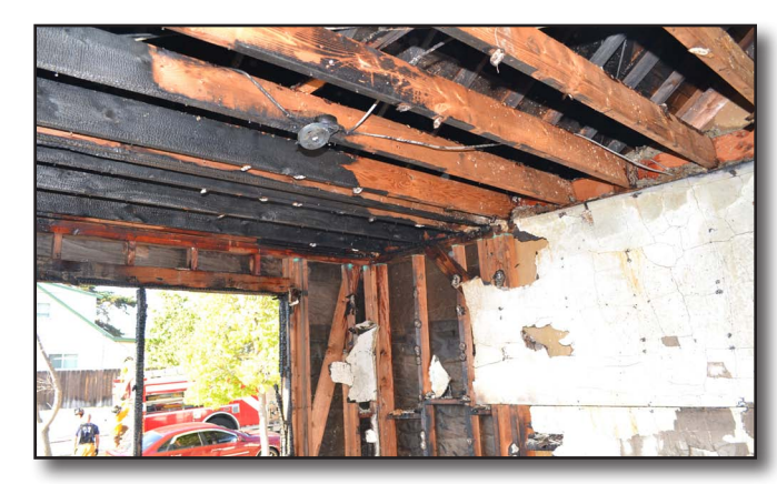
Figure 23-20 An attic fire necessitates the removal of all ceiling and insulation material. Blown in insulation is especially problematic in regards to rekindle and must be removed entirely, resulting in a lengthy overhaul process.

By examining the incident area thoroughly and finding hidden fires, firefighters can prevent rekindle. Suspect objects may be removed from the structure and soaked down. Areas having a rekindle potential may be kept under surveillance with a charged hose ready to attack any flare-ups.