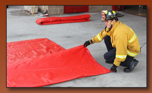
Fold one side of halfway to the center of the cover