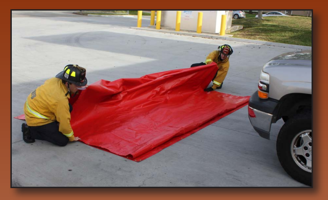
Accordion fold the cover