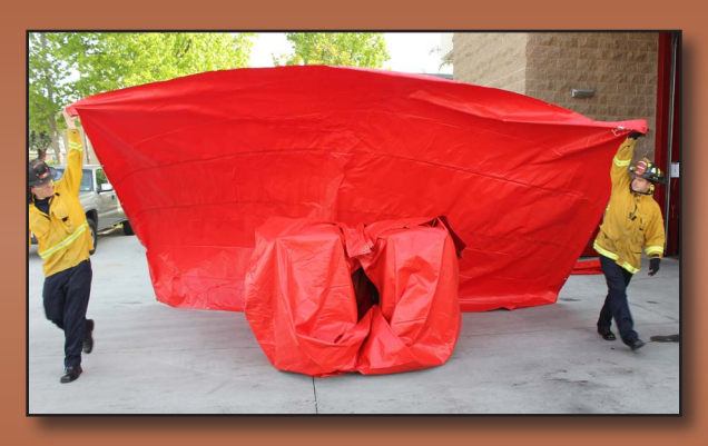
Cover the items with a second salvage cover