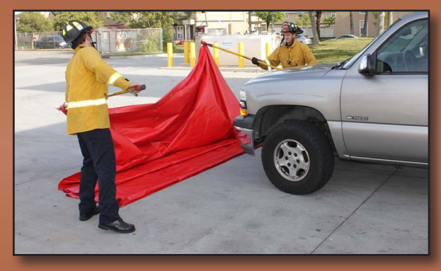
Working together, trap air under the cover by moving forward and backwards once or twice