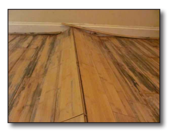
Figure 23-2 Water damage to wooden floors

The construction techniques employed during the development of the structure, as well as construction features will effect the ability of water to flow through floors and walls. Some construction materials and techniques are more permeable to water than others. The two basic construction styles are lightweight and conventional. Generally conventional construction styles offer greater stability when exposed to fire, and can withstand the added weight of water better than lightweight construction.