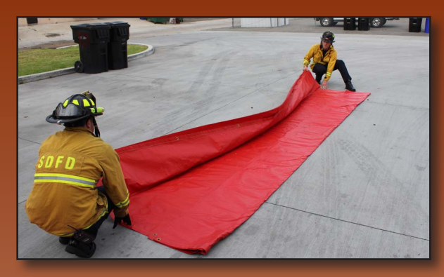
Unroll the savage cover and open up halfway, grasping both folds and keeping them together