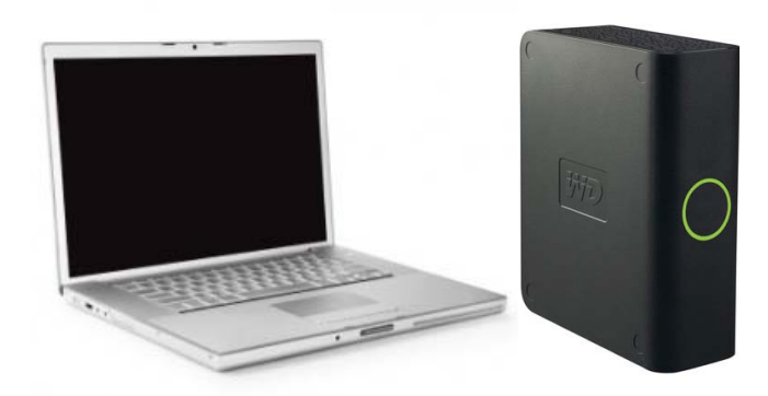
Figure 23-8 Electronics that contain important information, such as computers, laptops, hard drives, should be a priority for salvage