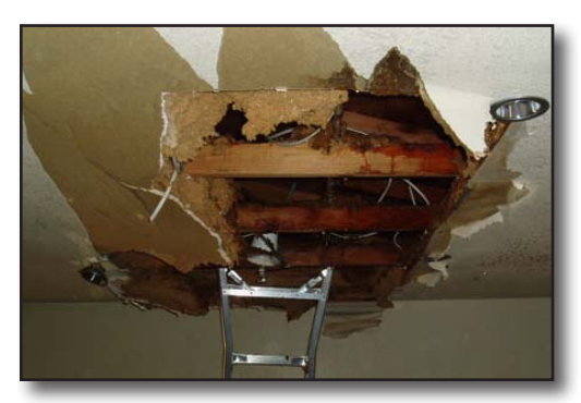
Figure 23-3 Gypsum becomes heavy when wet and ceilings may collapse without warning