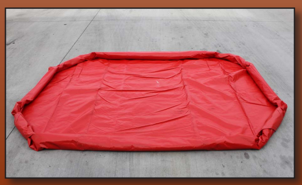
The finished small catch-all can now easily be transported by two firefighters to the necessary location