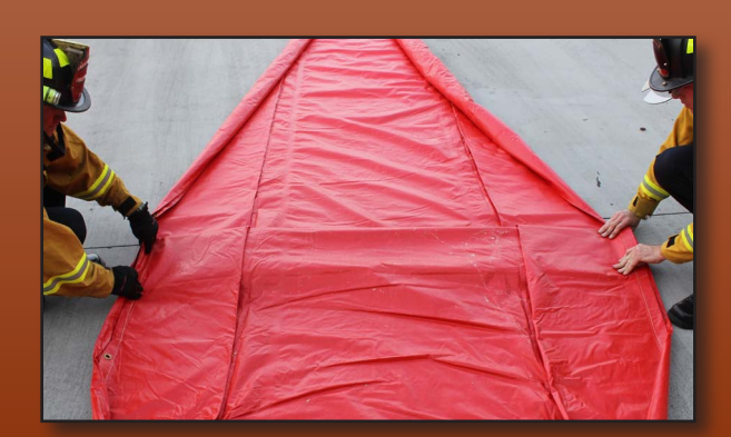
Next, fold over all layers of the flaps in the direction of the water travel to lock the two chutes in place