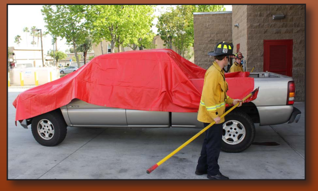
Allow the salvage cover to come to a rest and unhook the pike poles