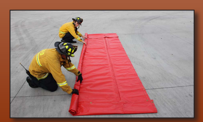
With a partner, roll one side of the cover to the center