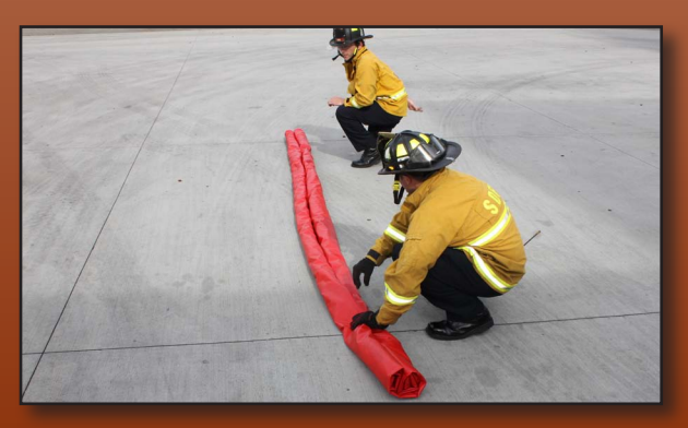
Roll the opposite side of the cover to the center. The chute is now assembled and can be folded in thirds for easy transport