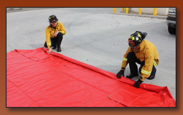
Roll one side of the cover inward approximately 2' to 3'