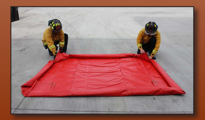
Roll in corners and lock in place with the inside flap