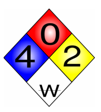
Figure 23-4 NFPA 704 Placard will indicate if material is water reactive

Examples of easily damaged materials include; electronic devices, paper goods, files, materials in cardboard boxes, dry goods such as flour, and fragile stock.