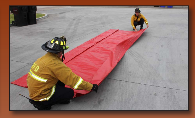
Open up the opposite side of the salvage cover, keeping both folds together