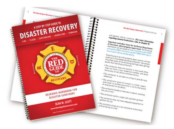
Figure 23-28 The Red Guide to Recovery, also referred to as the "Fire Victims Handbook," contains useful information and resources for the owners after the Fire Department leaves.

The San Diego Fire Department is not responsible for restoring utilities or water systems. However, they should supervise such action to ensure that fires are not rekindled or that no further damage results. Notify FCC of any utilities requiring servicing so they can contact the appropriate agency.