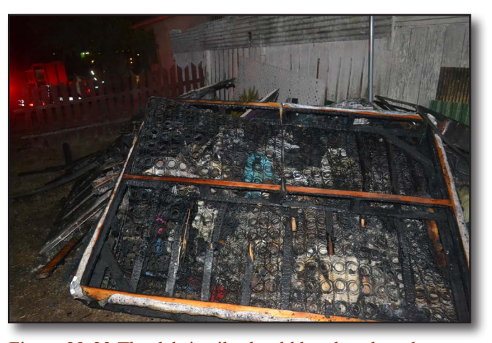
Figure 23-23 The debris pile should be placed on the property in a location that will not create any further damage to the structure should it re-ignite. Continuous wetting of the layers of the debris pile is often necessary to prevent a rekindle.

Overhaul usually begins at the top and works down. The firefighters should be careful not to scatter or cover any material that retains fire. Care should be taken to ensure that materials not on fire are not damaged by the overhaul operation. If at all possible, the undamaged and less damaged goods should be set aside in a safe area. Do not get into a habit of shoveling everything movable on a floor out a window. Pieces of burned flooring, lath and plaster, burned and unburned furniture and clothing, some of which might conceivably be salvageable, are sent flying out a window mixed with dirty water to make an unsightly pile. It is not uncommon to see this heap of debris rekindle with the result that it too must be overhauled. Firefighters who dump debris out a window onto valuable shrubbery or landscaping also cause additional loss.