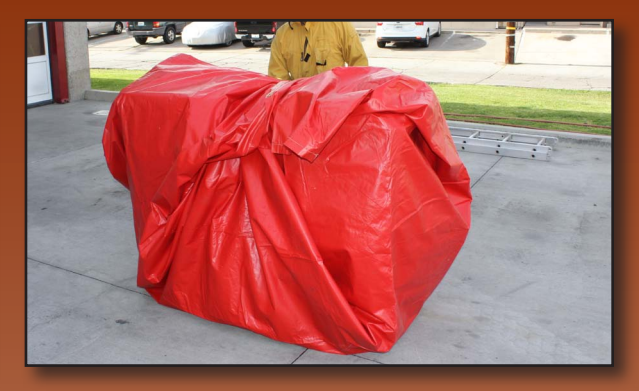
Wrap up as much of the items as possible with the salvage cover