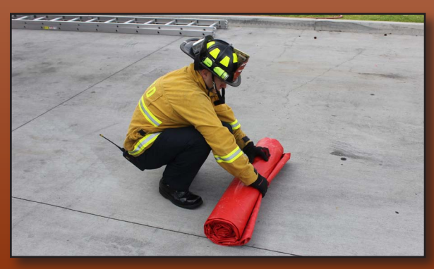
Finish rolling the cover