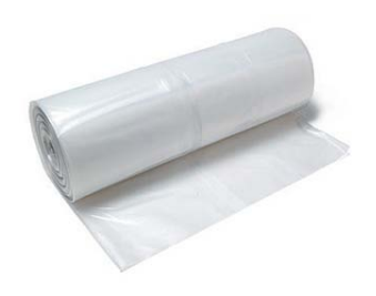
Figure 23-6 Visqueen

Hall runners are 3'x18' and are great for protecting the flooring in high traffic areas during fire suppression and overhaul.