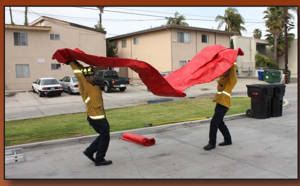
On command, both firefighters walk backwards and snap open the salvage cover by throwing both arms up and outward, maintaining your grip